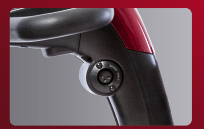
Charger port located conveniently in tiller.