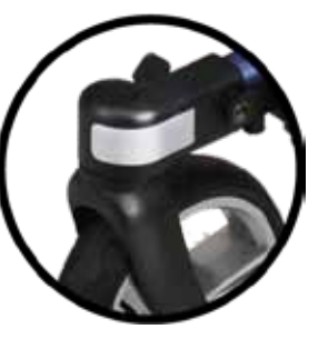
Cane & Umbrella Holder