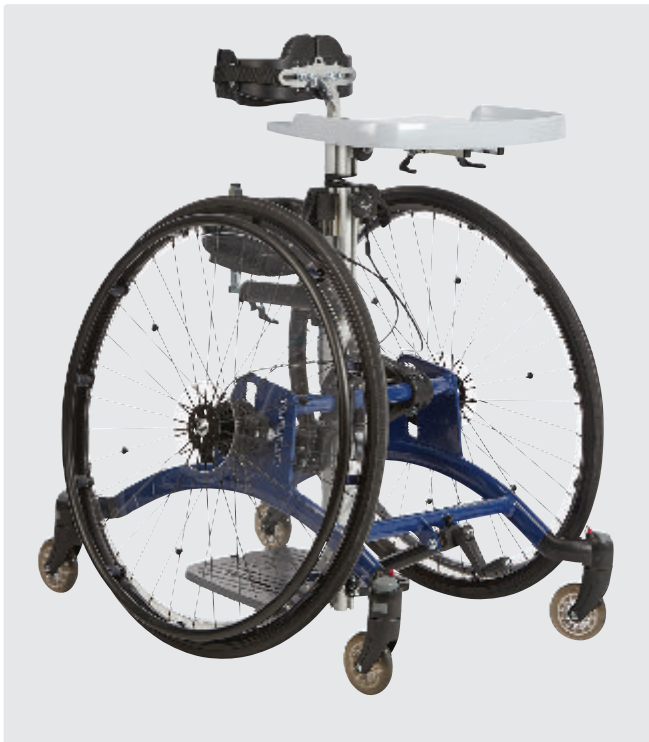
2 driving wheels 4 castors with or without brakes.