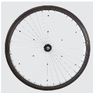
Available in 22", 24", 26", 29", 32", 36"