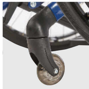
Without brakes (driving wheels must be fitted)