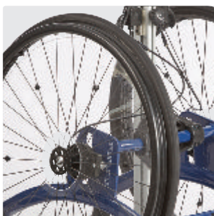
Closed push rims