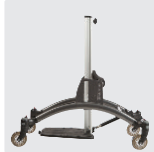
Size 3: Anthracite grey