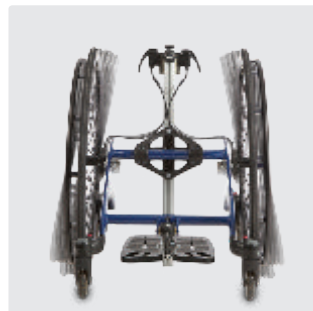
Standard camber angle: Size 1: 8°, Size 2: 6°, Size 3: 6°, Size 4: 4° Available to choose standard plus: +3°, +6°, -3°, -6°