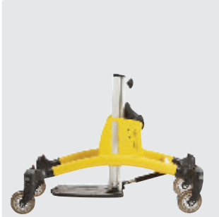
Size 1: Yellow