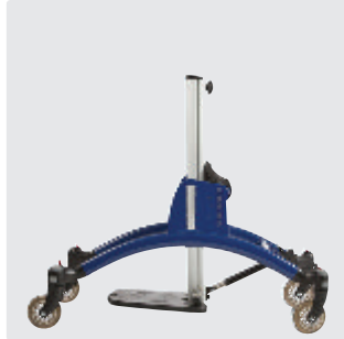
Size 2: Blue