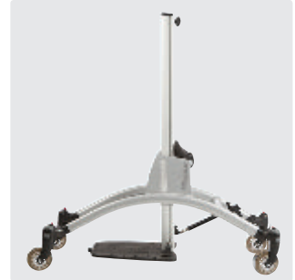
Size 4: Silver