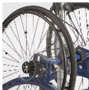
Open push rims