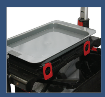
Plastic Tray 500-4300