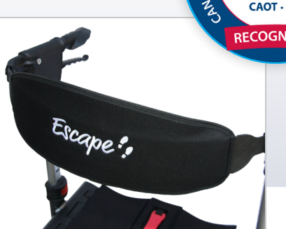
Large adjustable padded backrest