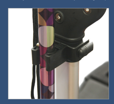
Cane Holder (cane not included) 500-4100

Escape offers a variety of high-quality accessories that help enhance the walker comfort and performance. These can be purchased separately.