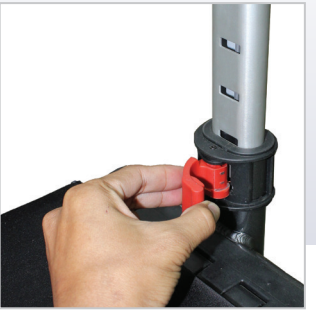
Easy to adjust handle height