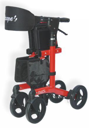
Spring-assist Folding Folds with a single lift of the seat handle.