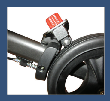
Slow Down Brake 500-4000